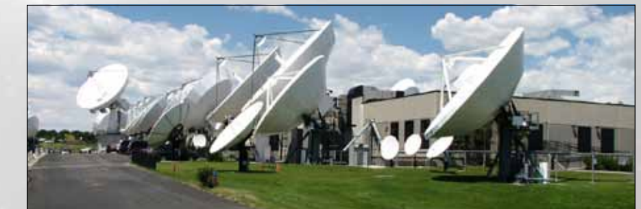
EchoStar Broadcast Center • Cheyenne, WY

EchoStar's digital fiber-optic network has point of presence in 210 cities across the United States and several countries worldwide. Our highly reliable global network is used to aggregate and distribute video and audio content for our domestic and international customers.