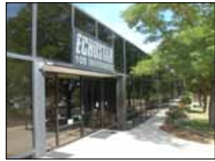
EchoStar HQ • Englewood, CO

EchoStar Corporation (NASDAQ: SATS) is the premier global provider of satellite services and video delivery solutions.